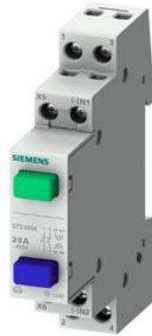
button, 1 NO/1 NC 20 A 1 key green without latching function