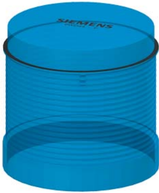
Flashlight element, with integrated LED, blue, 115 V AC, Diameter 70 mm