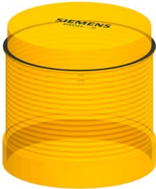
Flashlight element, with integrated LED, yellow, 115 V AC, Diameter 70 mm