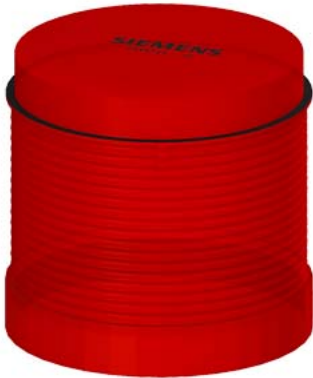
Continuous light element, with integrated LED, red, 115 V AC, Diameter 70 mm