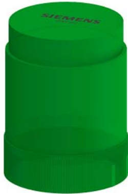
Flashlight element, with integrated LED, green, 230 V AC, Diameter 50 mm