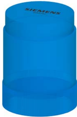
Flashlight element, with integrated LED, blue, 115 V AC, Diameter 50 mm