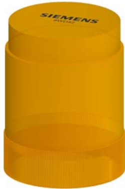
Flashlight element, with integrated LED, yellow, 115 V AC, Diameter 50 mm