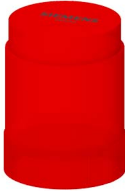
Flashlight element, with integrated LED, red, 115 V AC, Diameter 50 mm