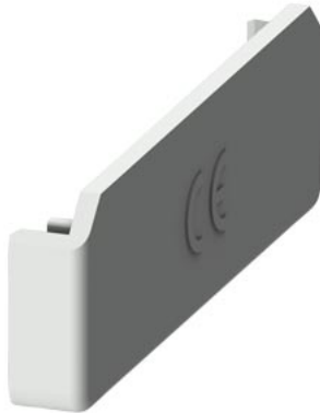
end cap for pin busbar compact 10 units safe to touch