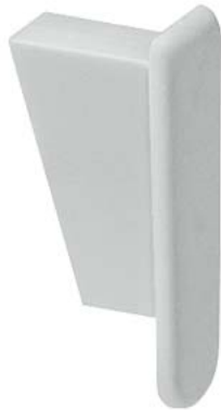
End cap for pin busbars 1-phase