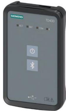
TD400 Kit commissioning and service tool IEC 3WL (Release 2) and 3VA TD400 Kit with Adapter, cable, and suitcases