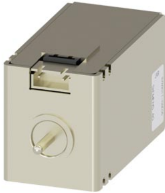
undervoltage release UVR 120...127 V AC/DC accessories for circuit breakers 3WL10 / 3VA27