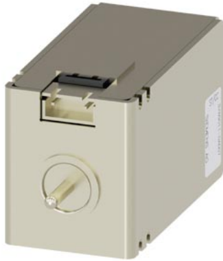
auxiliary solenoid 220...240 V AC/DC shunt release/closing coil (ST/CC) accessories for circuit breakers 3WL10 / 3VA27