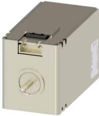
auxiliary solenoid 120...127 V AC/DC shunt release/closing coil (ST/CC) accessories for circuit breakers 3WL10 / 3VA27