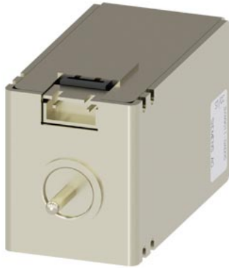
auxiliary solenoid 110...120 V AC/DC shunt release/closing coil (ST/CC) accessories for circuit breakers 3WL10 / 3VA27