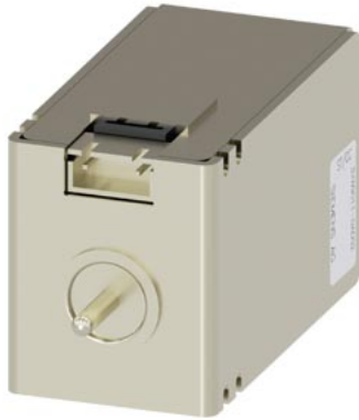
auxiliary solenoid 30 V AC/DC shunt release/closing coil (ST/CC) accessories for circuit breakers 3WL10 / 3VA27