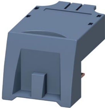
Cable connector size S0 Spring-type terminal