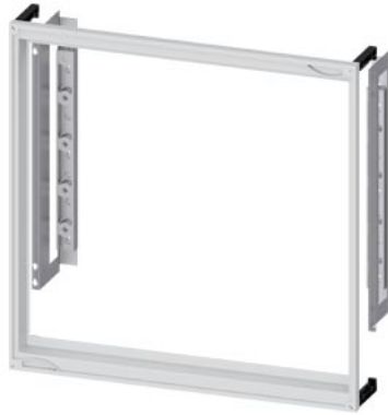
ALPHA 630/1250 DIN assembly kit in-line fuse switch disconnectors 6x 3NJ4... NH1-3 H = 750 mm, W = 750 mm