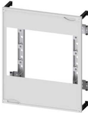
ALPHA 630/1250 DIN assembly kit in-line fuse switch disconnectors 9x 3NJ4... NH00 H = 600 mm, W = 500 mm