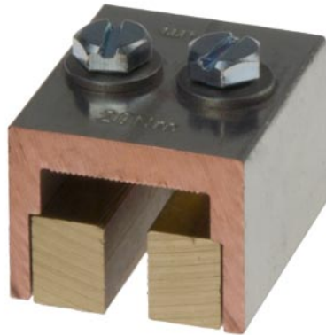
Busbar connector for Double T-Profile 1600A