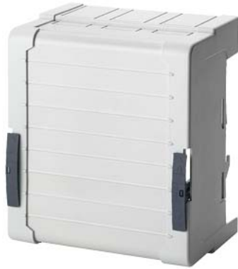
busbar system, accessory busbar center-to-center spacing 60 mm cover for 8US1941-2AA03/04