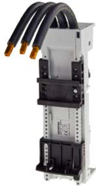
Device adapter S2, 80 A, short AWG4 25 mm 2 150 mm 150° Length 200 mm, Width 54 mm