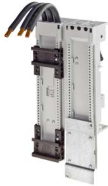
Device adapter S2, 80 A, Reversing feeder AWG4 25 mm 2 150 mm 150° Length 260 mm, Width 118 mm