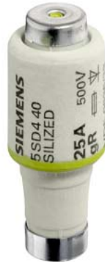
SILIZED fuse link 500 V for semiconductor protection Quick-acting, Size DII, E27, 25A