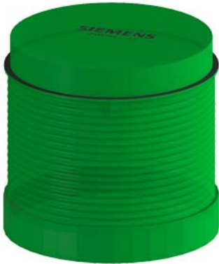
rotating light element, with integrated LED, green, 24 V AC/DC, Diameter 70 mm