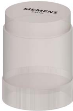
Single-flash light element, clear, 24 V DC, diameter 50 mm