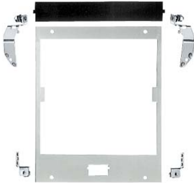
Accessory for switch 3NP5060 Assembly kit with molded plastic cover 250 x 149 mm