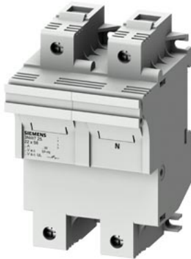
SENTRON, cylindrical fuse holder, 22x58 mm, 1P+N, In: 100 A, Un AC: 690 V, LED signal detector