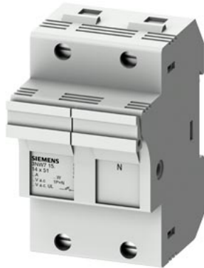
SENTRON, cylindrical fuse holder, 14x51 mm, 1P+N, In: 50 A, Un AC: 690 V