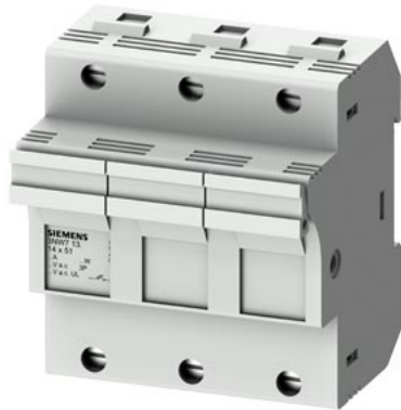
SENTRON, cylindrical fuse holder, 14x51 mm, 3-pole, In: 50 A, Un AC: 690 V