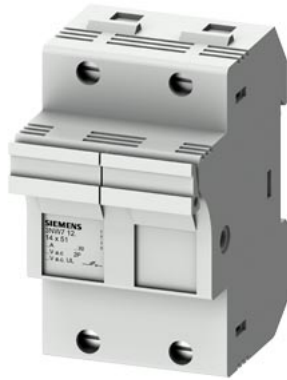
SENTRON, cylindrical fuse holder, 14x51 mm, 2-pole, In: 50 A, Un AC: 690 V