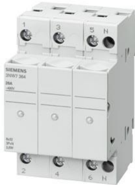
SENTRON, cylindrical fuse holder, 10x38 mm, 3P+N, In: 32 A, Un AC: 690 V, LED signal detector