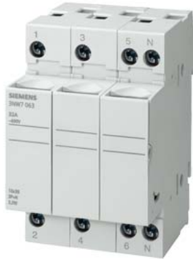
SENTRON, cylindrical fuse holder, 10x38 mm, 3P+N, In: 32 A, Un AC: 690 V