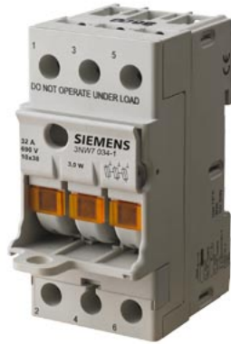
SENTRON, cylindrical fuse holder, 10x38 mm, 3-pole, In: 32 A, Un AC: 690 V, LED signal detector, compact version