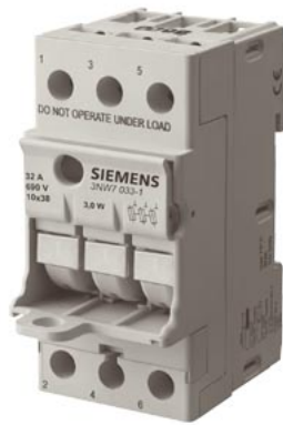
SENTRON, cylindrical fuse holder, 10x38 mm, 3-pole, In: 32 A, Un AC: 690 V, compact version