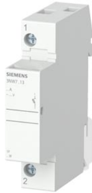
SENTRON, cylindrical fuse holder, 10x38 mm, 1-pole, In: 32 A, Un AC: 690 V