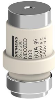
NEOZED fuse-link, D03, 80 A, gG, Un AC: 400 V, Un DC: 250 V