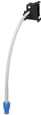
Cable release for reset 0.6 m for 3RU2 Size S00...S3