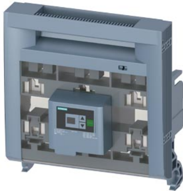
Handle unit with EFM25, for Size NH3, accessory for fuse switch disconnectors 3NP1