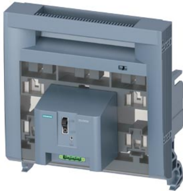
Handle unit with MFM, for Size NH3, accessory for fuse switch disconnectors 3NP1