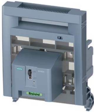
Handle unit with MFM, for Size NH2, accessory for fuse switch disconnecter 3NP1