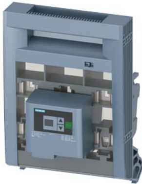
Handle unit with EFM20, for Size NH1, accessory for fuse switch disconnecter 3NP1