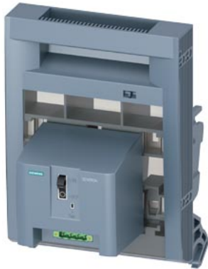
Handle unit with MFM, for Size NH1, accessory for fuse switch disconnecter 3NP1