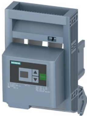
Handle unit with EFM25, for Size NH00, accessory for fuse switch disconnector 3NP1