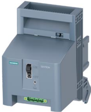
Handle unit with MFM, for Size NH00, accessory for fuse switch disconnector 3NP1