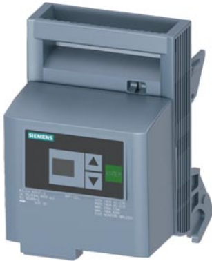
Handle unit with EFM20, for Size NH000, accessory for fuse switch disconnecter 3NP1