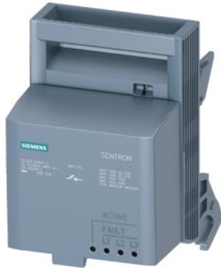
Handle unit with EFM10, for Size NH000, accessory for fuse switch disconnecter 3NP1