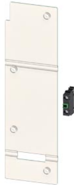
accessories for switch disconnector with fuses in-line design, plug-in, NH00 auxiliary switch 1 NO with cover