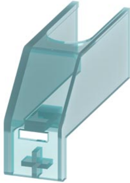
Terminal cover, for 1-pole, Accessories for load disconnecter 3LD3