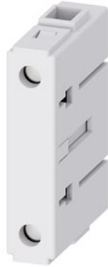
PE-through terminal, Floor installation, accessory for Load disconnecter 3LD3